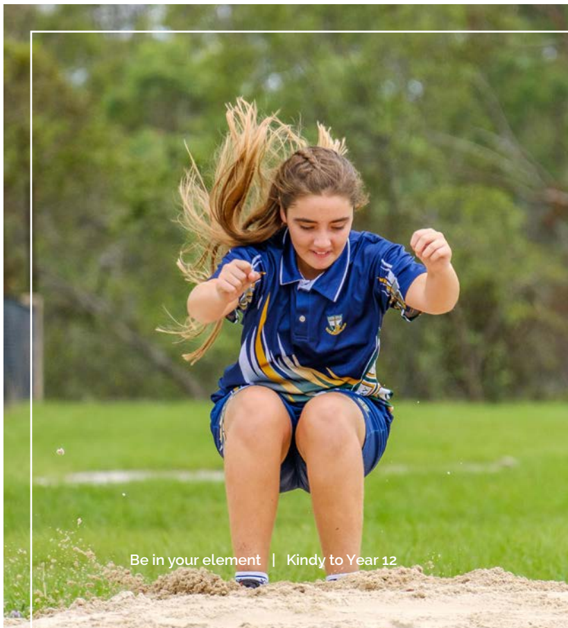
Be in your element | Kindy to Year 12